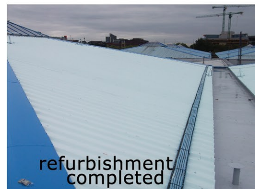
Metal Sheets SCL 95 Cladding Finish