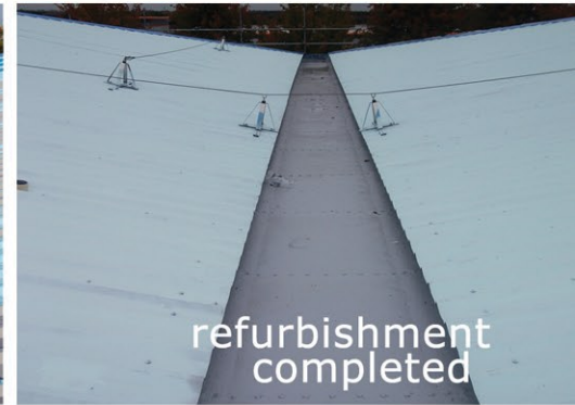
Metal Gutters SCL 90 Durathane System

Many industrial estates are in urgent need of refurbishment. Flaking paint on vertical cladding, shutter doors and cladding roofs are reducing unit appearances and discouraging visits from customers. Unit owners are now beginning to realise how the state of exterior buildings has a direct impact on the perception of their business.